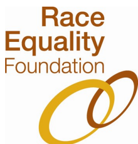
Race Equality Foundation