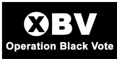
Operation Black Vote